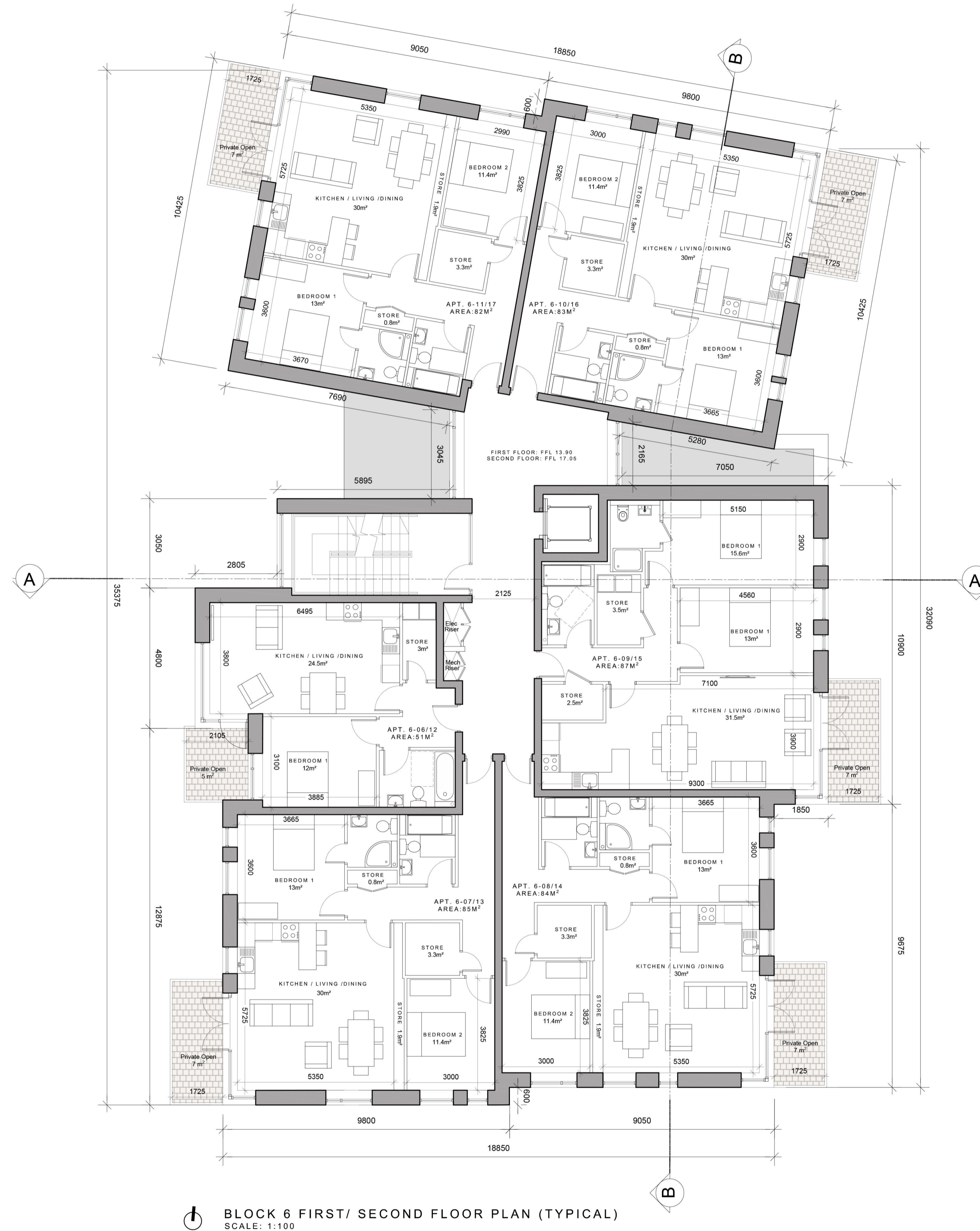
BLOCK 6 FIRST/ SECOND FLOOR PLAN (TYPICAL) SCALE: 1:100