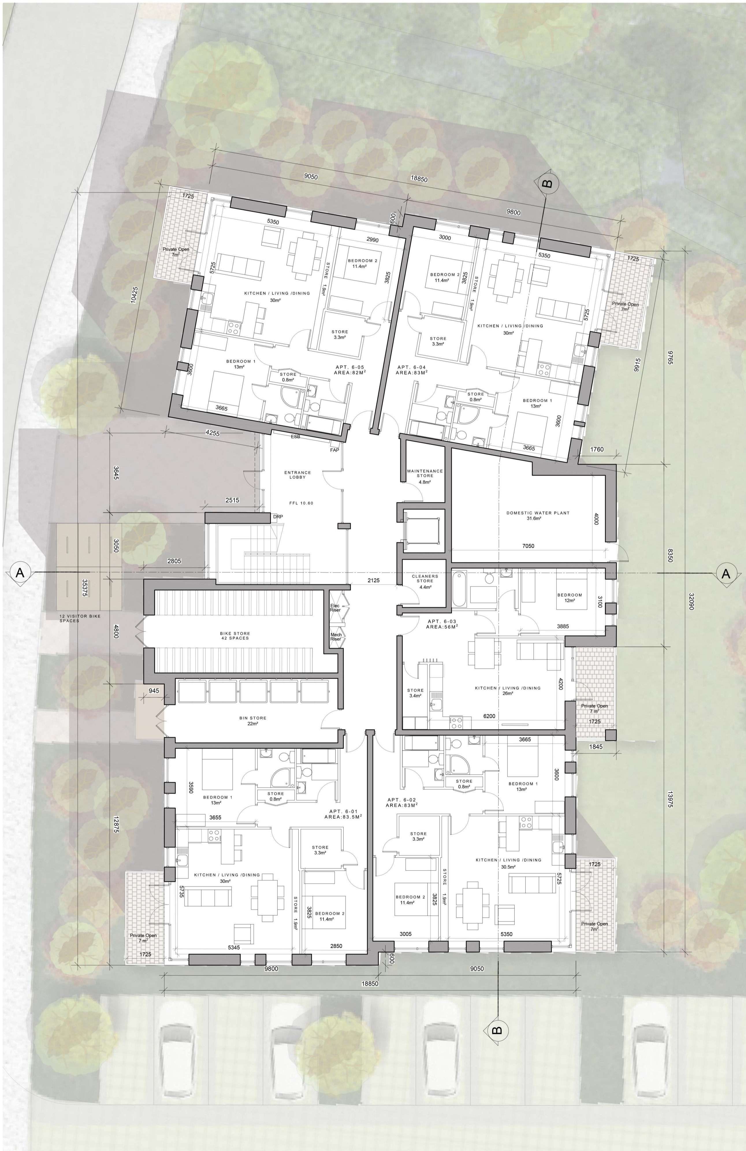
BLOCK 6 GROUND FLOOR PLAN SCALE: 1:100 SEE THE BIG SPACE LANDSCAPE ARCHITECTS DRAWINGS FOR DETAIL OF LANDSCAPE TREATMENT