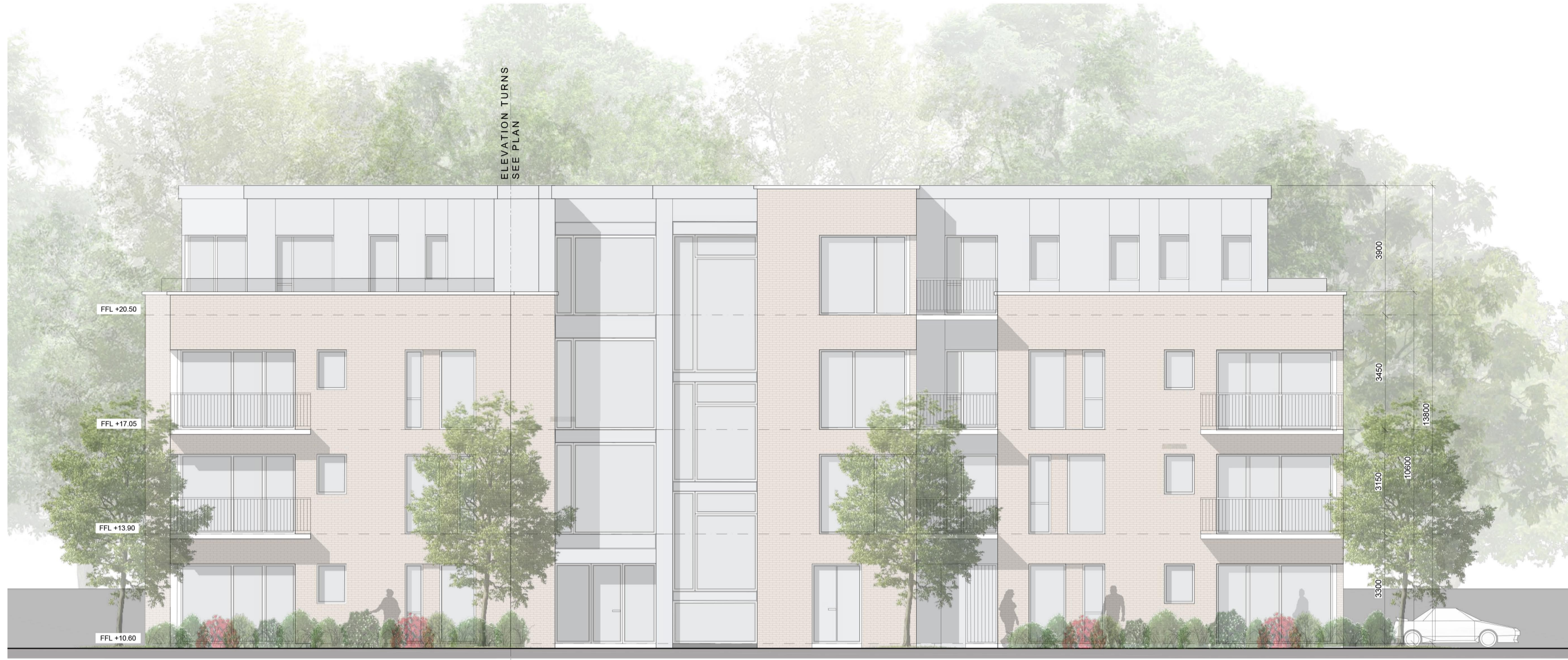
BLOCK 6 WEST FACING ELEVATION SCALE: 1:100 MATURE PLANTING BEYOND SHOWN INDICATIVELY.