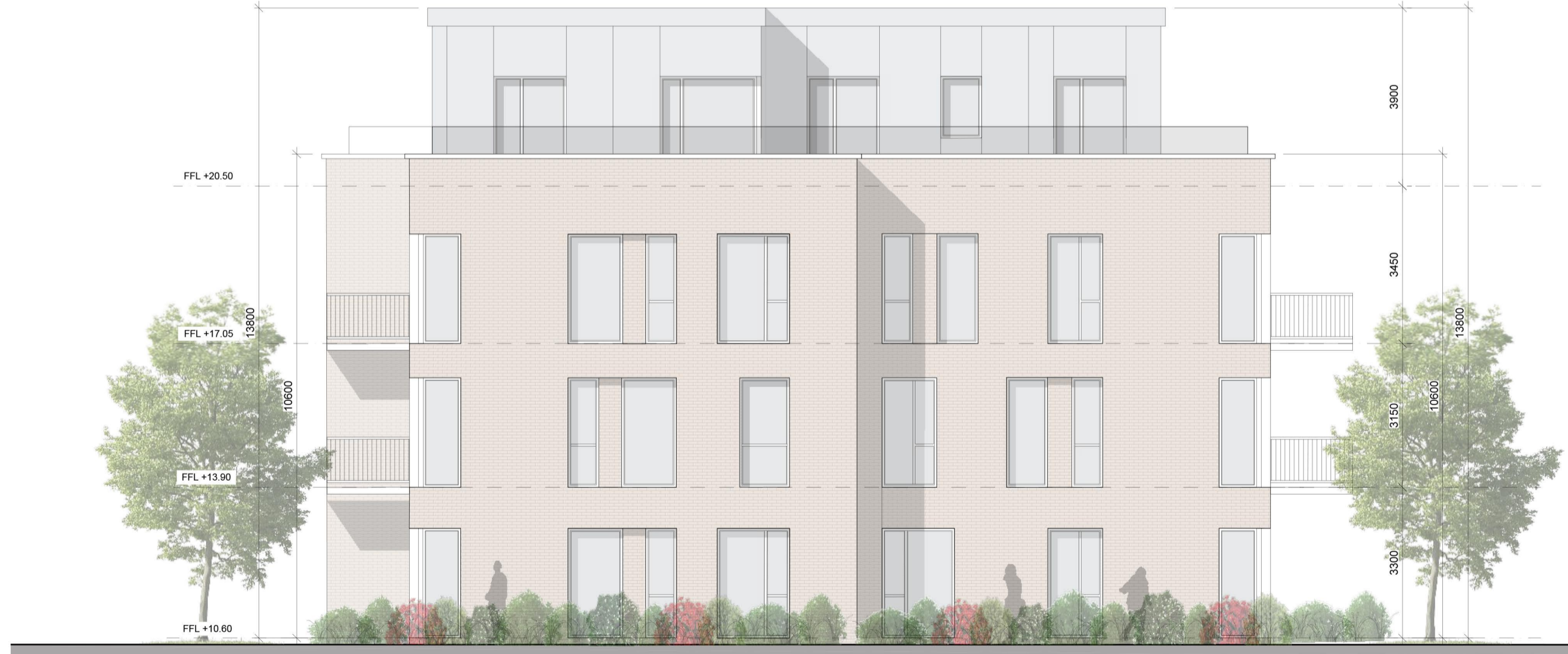
BLOCK 6 NORTH FACING END ELEVATION SCALE: 1:100