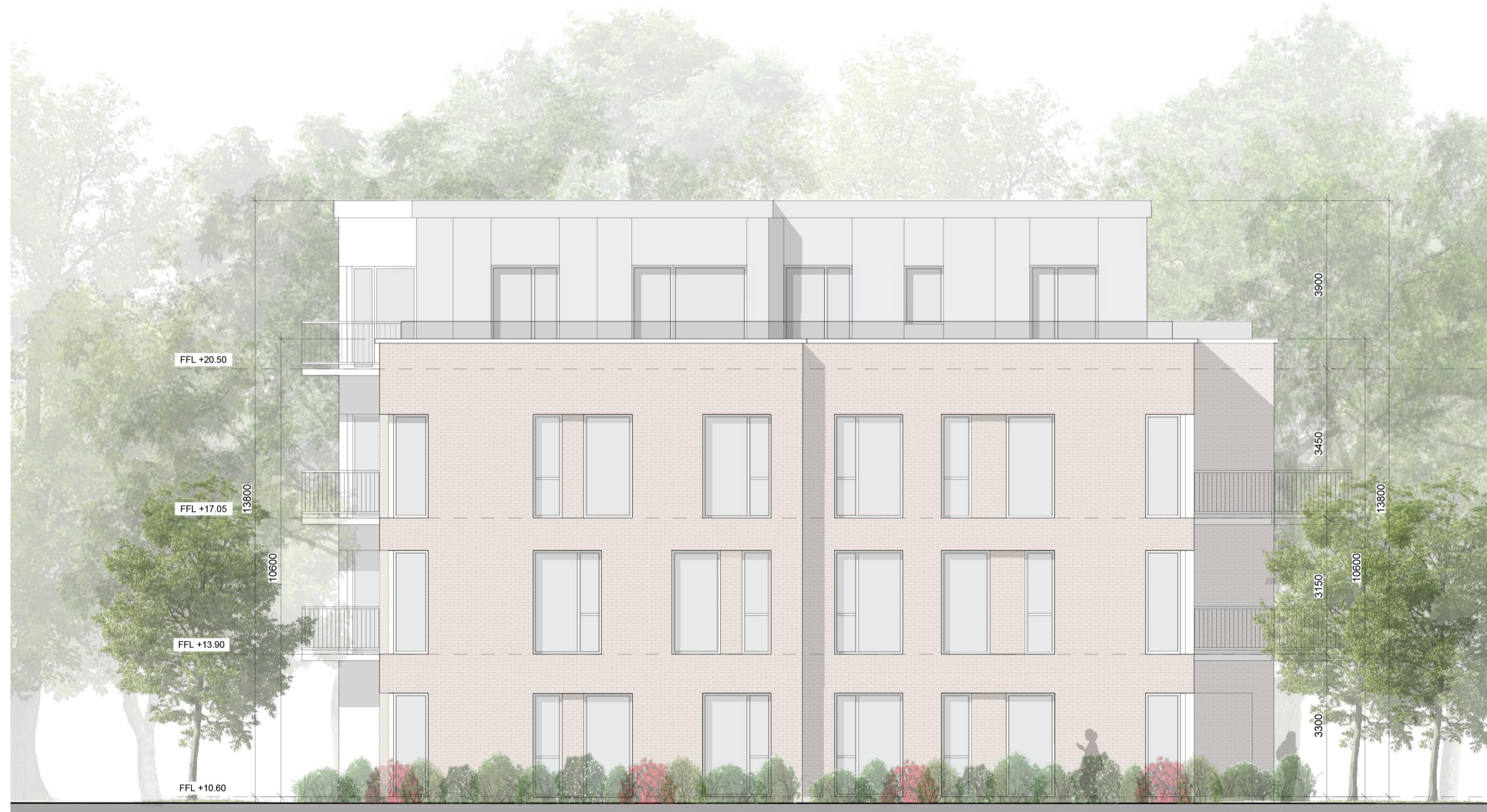
BLOCK 6 SOUTH FACING END ELEVATION SCALE: 1:100 MATURE PLANTING BEYOND SHOWN INDICATIVELY.