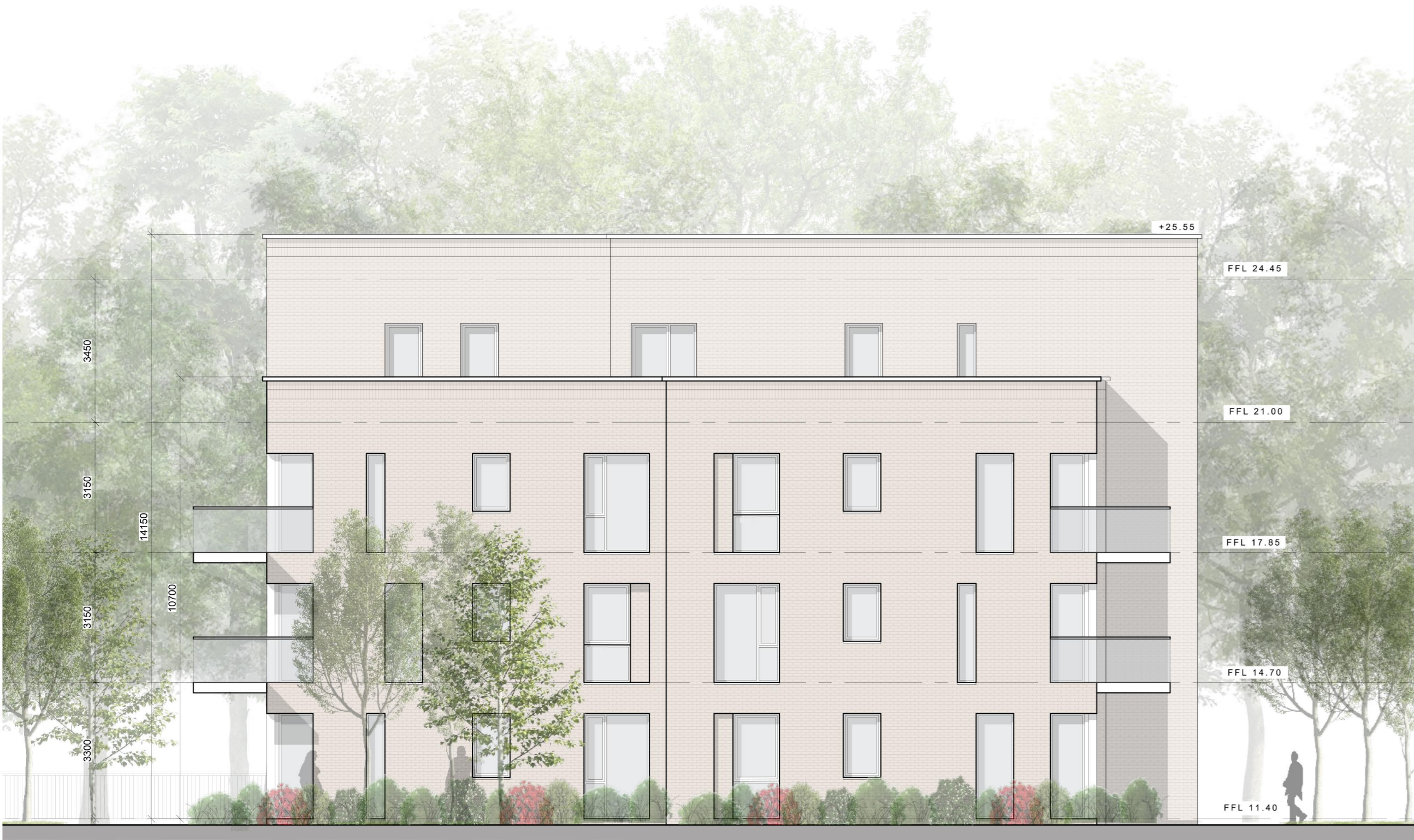
BLOCK 1 NORTH FACING ELEVATION SCALE: 1:100 MATURE PLANTING BEYOND SHOWN INDICATIVELY