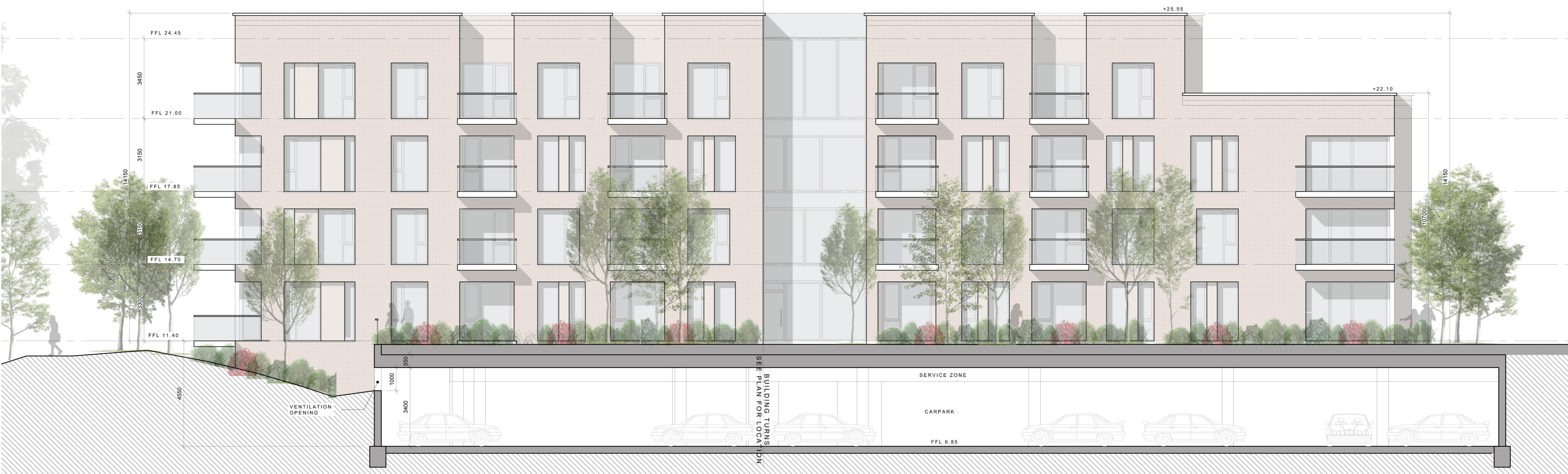
BLOCK 1 EAST FACING ELEVATION SCALE: 1:100