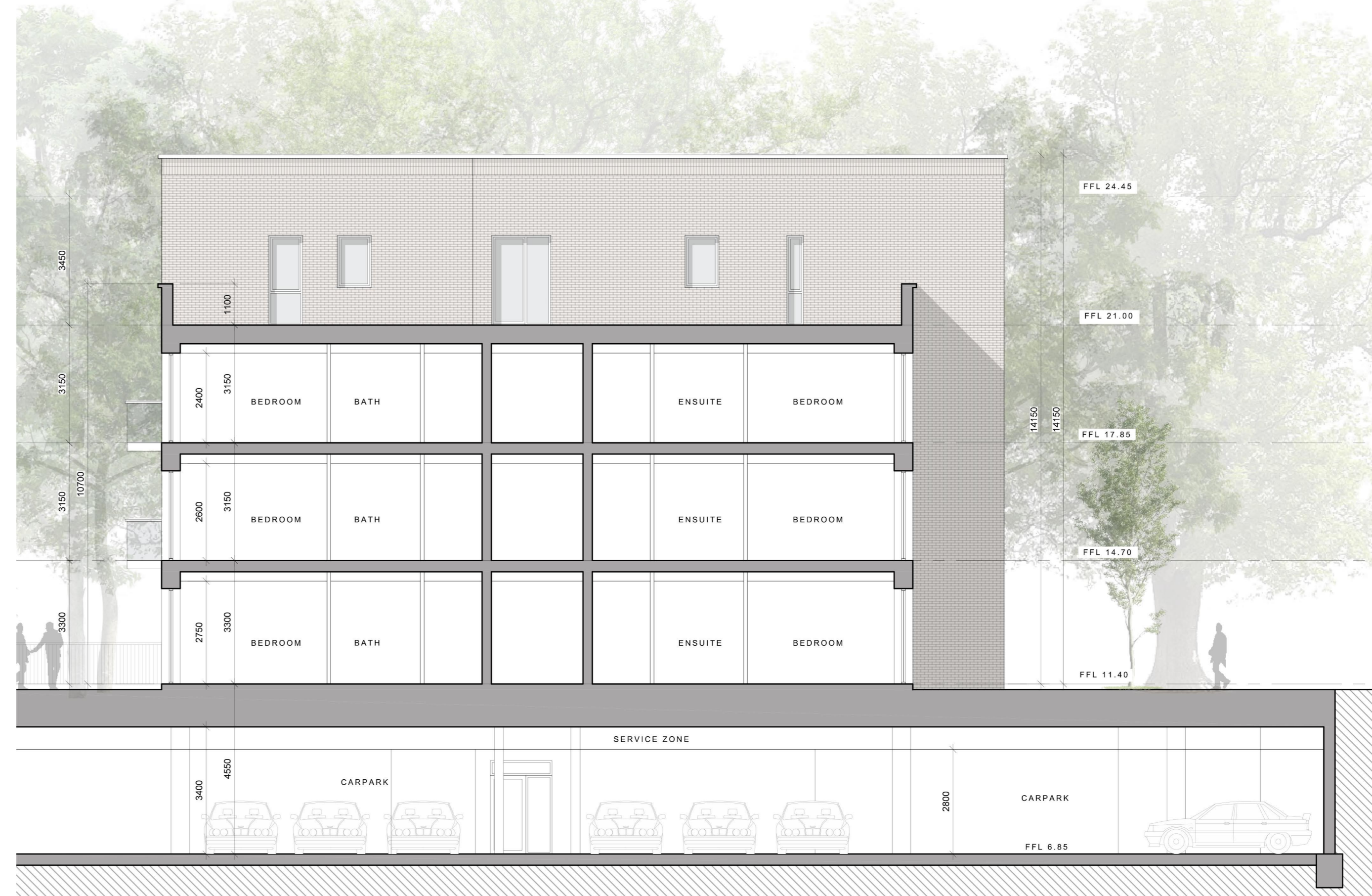
BLOCK 1 SECTION B - B SCALE: 1:100 MATURE PLANTING BEYOND SHOWN INDICATIVELY