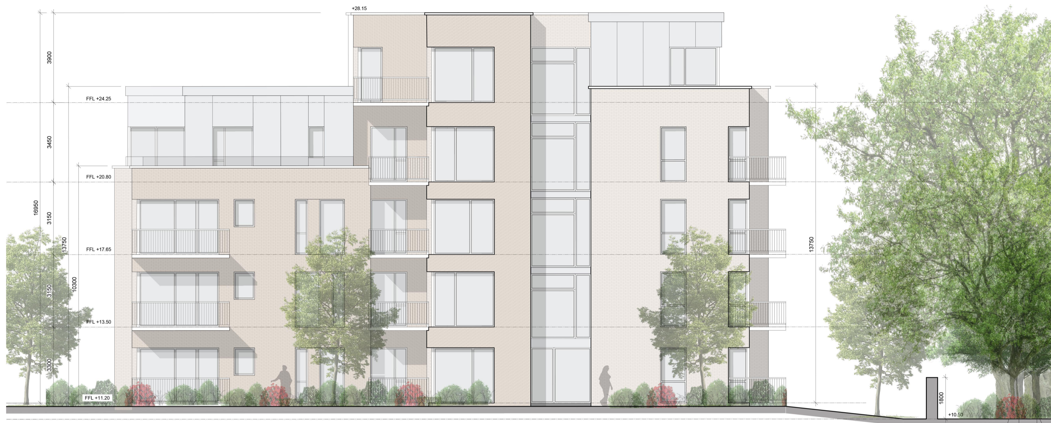
BLOCK 7 SOUTH FACING ELEVATION SCALE: 1:100

THROUGH WALL VENTILATION THROUGH WALL VENTILATION THROUGH WALL VENTILATION THROUGH WALL VENTILATION