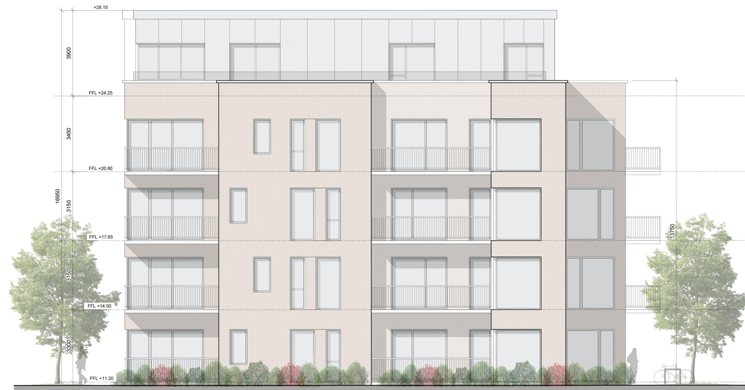
BLOCK 7 EAST FACING ELEVATION SCALE: 1:100