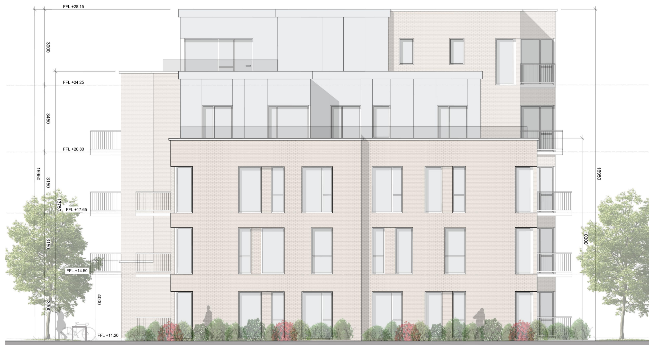
BLOCK 7 WEST FACING ELEVATION SCALE: 1:100

THROUGH WALL VENTILATION THROUGH WALL VENTILATION THROUGH WALL VENTILATION THROUGH WALL VENTILATION