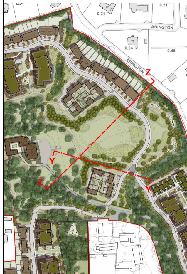
KEY PLAN INDICATES POSITION OF SITE SECTIONS. NOTE: NOT TO SCALE © Ordnance Survey Ireland and Government of Ireland Licence No. CYAL50248313

FOUNDATIONS: REFER TO STRUCTURAL ENGINEER'S REPORT FOR FURTHER DETAILS ON STRUCTURE/FOUNDATION DESIGN