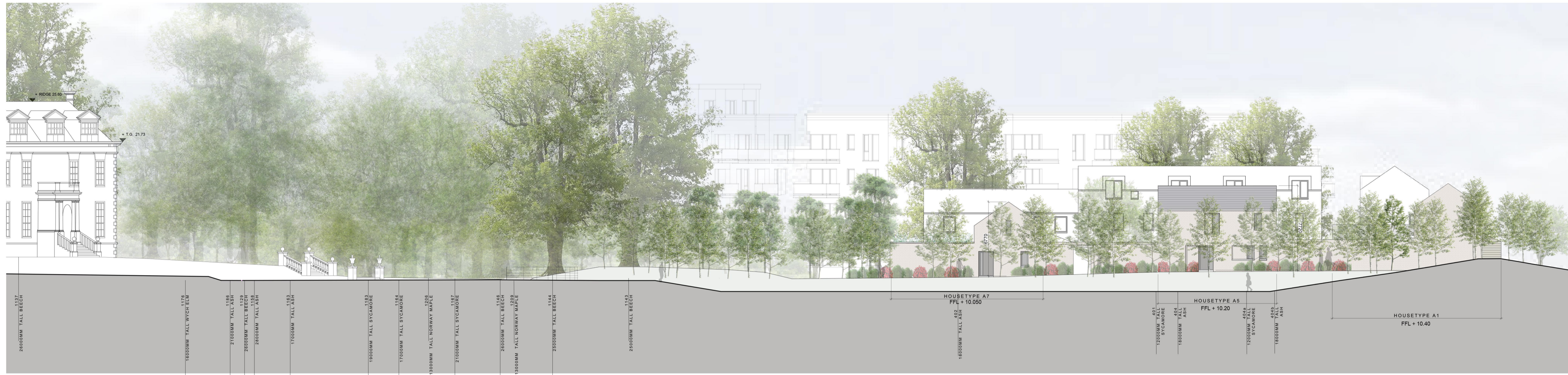
SITE SECTION Z - Z SCALE: 1:200 NOTE: SEE LANDSCAPE ARCHITECTS DRAWINGS FOR BOUNDARY TREATMENTS SEE ARBORISTS REPORT FOR DETAIL ON EXISTING TREES DOTTED RED LINE INDICATES SITE BOUNDARY