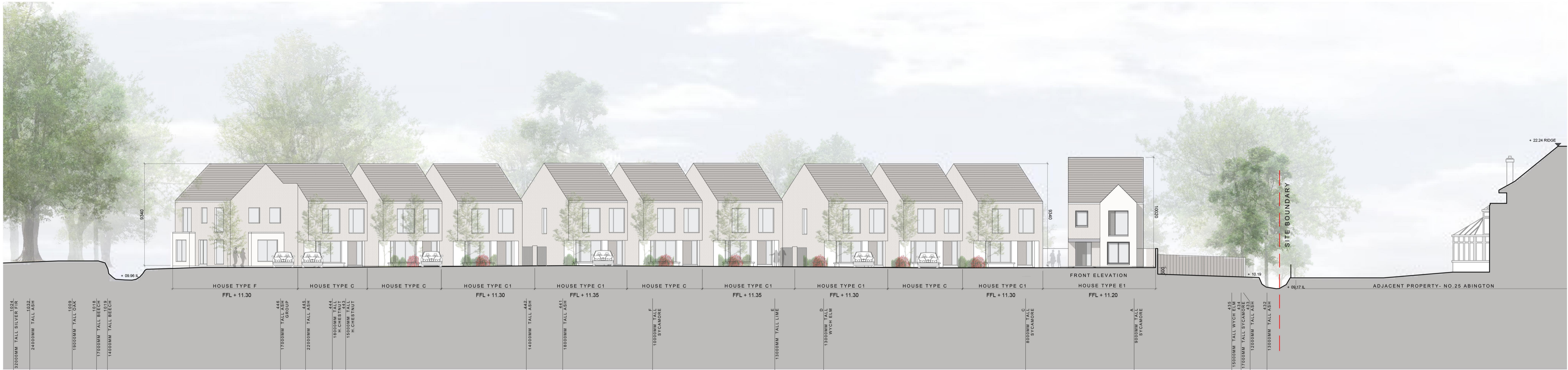
SITE SECTION J - J SCALE: 1:200 NOTE: SEE LANDSCAPE ARCHITECTS DRAWINGS FOR BOUNDARY TREATMENTS SEE ARBORISTS REPORT FOR DETAIL ON EXISTING TREES DOTTED RED LINE INDICATES SITE BOUNDARY