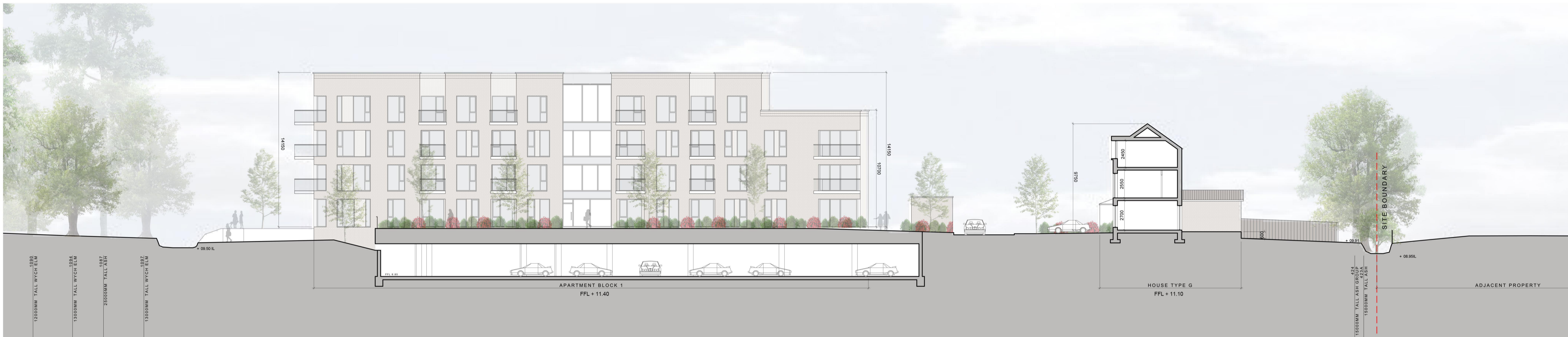
SITE SECTION K - K SCALE: 1:200 NOTE: SEE LANDSCAPE ARCHITECTS DRAWINGS FOR BOUNDARY TREATMENTS SEE ARBORISTS REPORT FOR DETAIL ON EXISTING TREES DOTTED RED LINE INDICATES SITE BOUNDARY