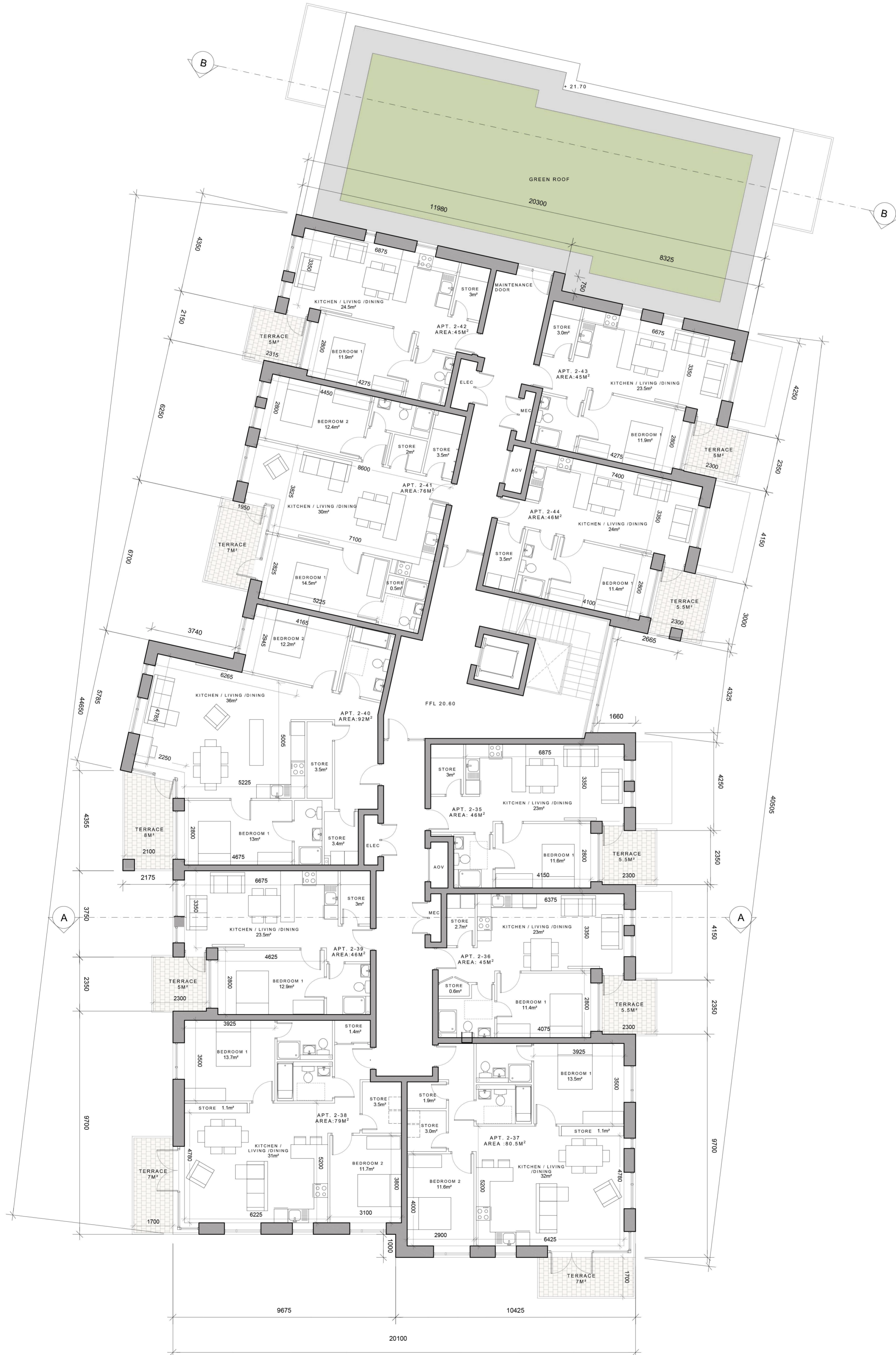
BLOCK 2 THIRD FLOOR PLAN SCALE: 1:100

NOT TO SCALE © Ordnance Survey Ireland and Government of Ireland Licence No. CYAL50248313