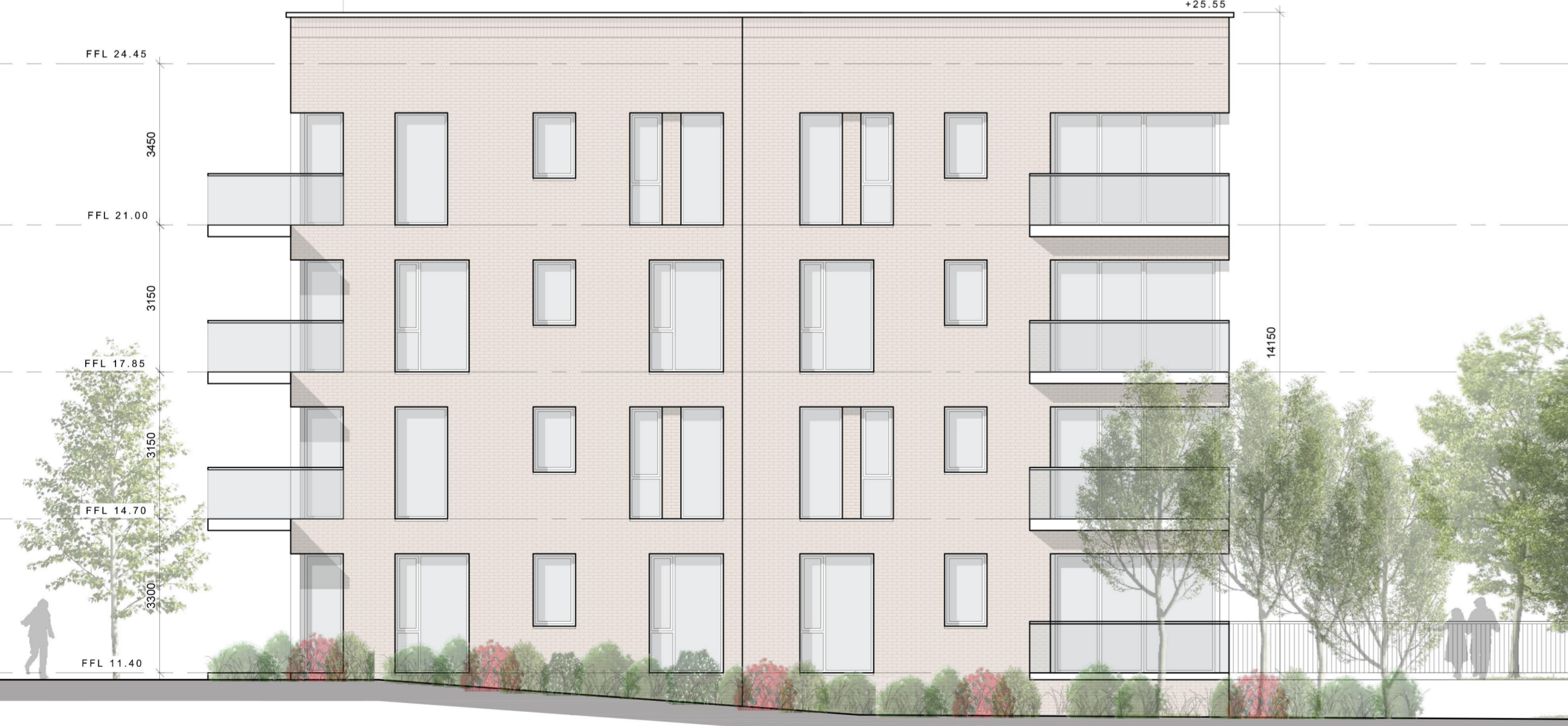
BLOCK 1 SOUTH FACING ELEVATION SCALE: 1:100