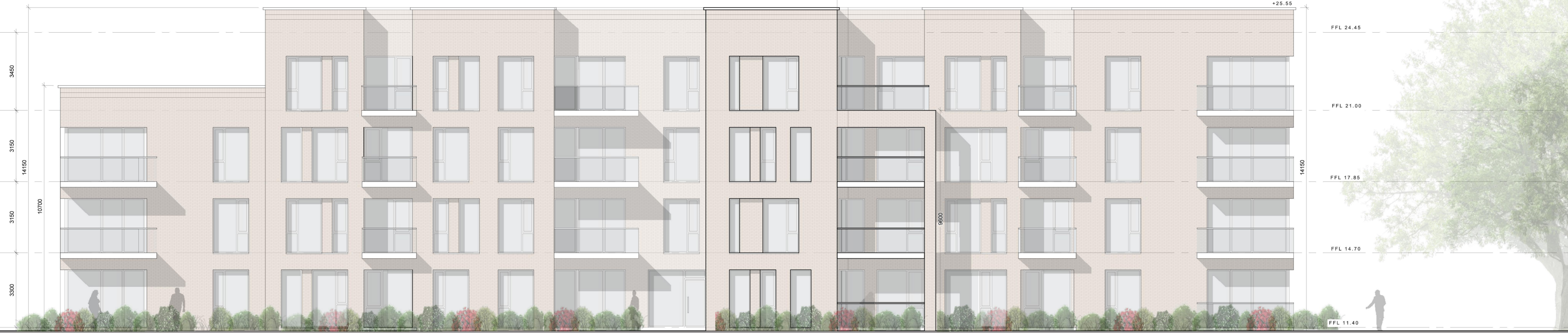
BLOCK 1 WEST FACING ELEVATION SCALE: 1:100