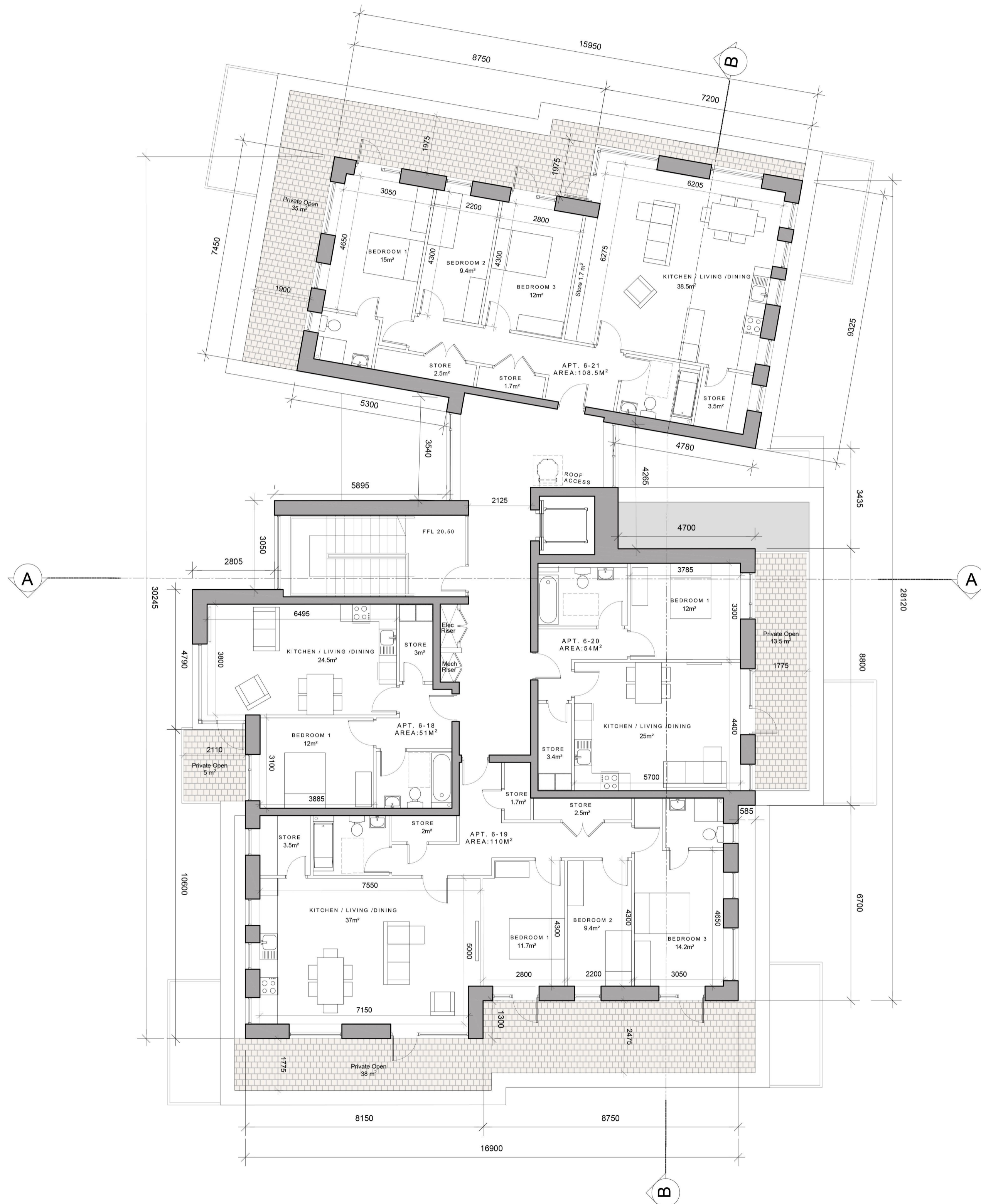
BLOCK 6 THIRD FLOOR PLAN SCALE: 1:100

KEY PLAN INDICATING POSITION OF APARTMENT BLOCK 6 NOT TO SCALE © Ordnance Survey Ireland and Government of Ireland Licence No. CYAL50248313