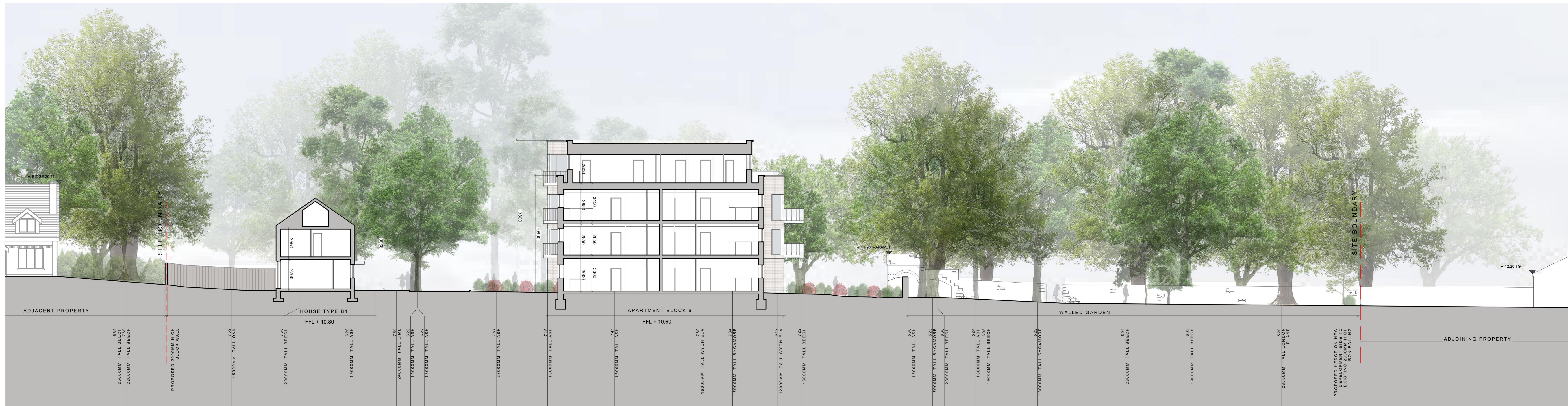
SITE SECTION A - A SCALE: 1:200 NOTE: SEE LANDSCAPE ARCHITECTS DRAWINGS FOR BOUNDARY TREATMENTS SEE ARBORISTS REPORT FOR DETAIL ON EXISTING TREES DOTTED RED LINE INDICATES SITE BOUNDARY