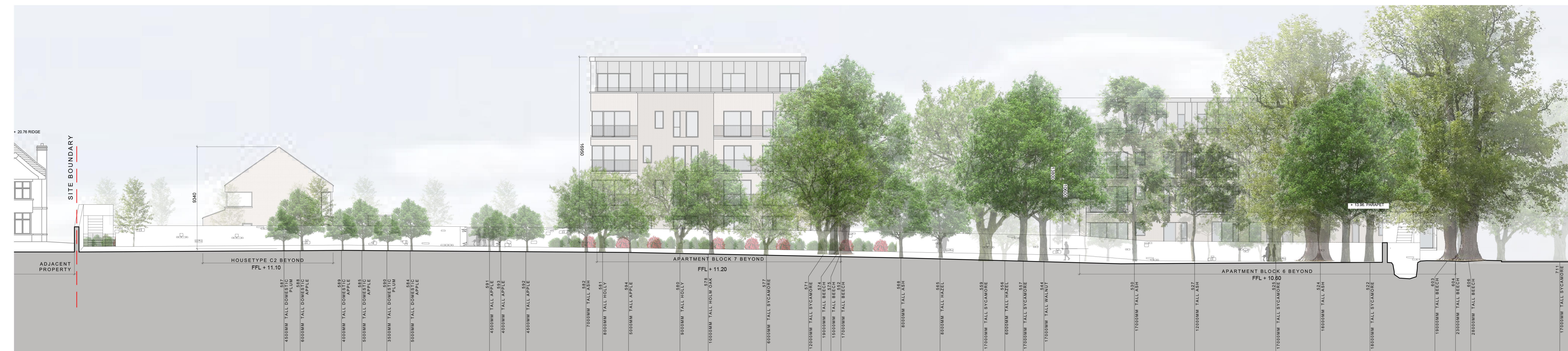
SITE SECTION B - B SCALE: 1:200 NOTE: SEE LANDSCAPE ARCHITECTS DRAWINGS FOR BOUNDARY TREATMENTS SEE ARBORISTS REPORT FOR DETAIL ON EXISTING TREES DOTTED RED LINE INDICATES SITE BOUNDARY