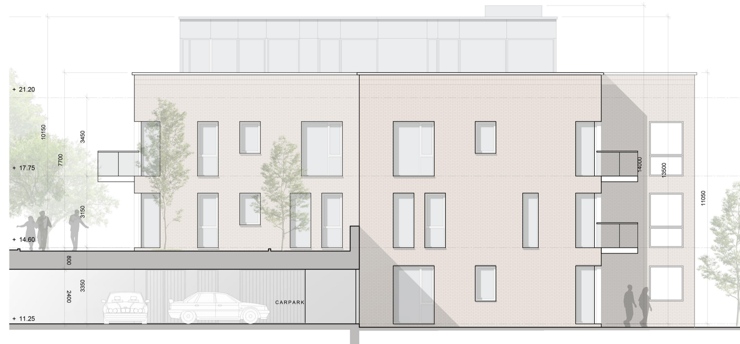
BLOCK 4 NORTH FACING END ELEVATION SCALE: 1:100