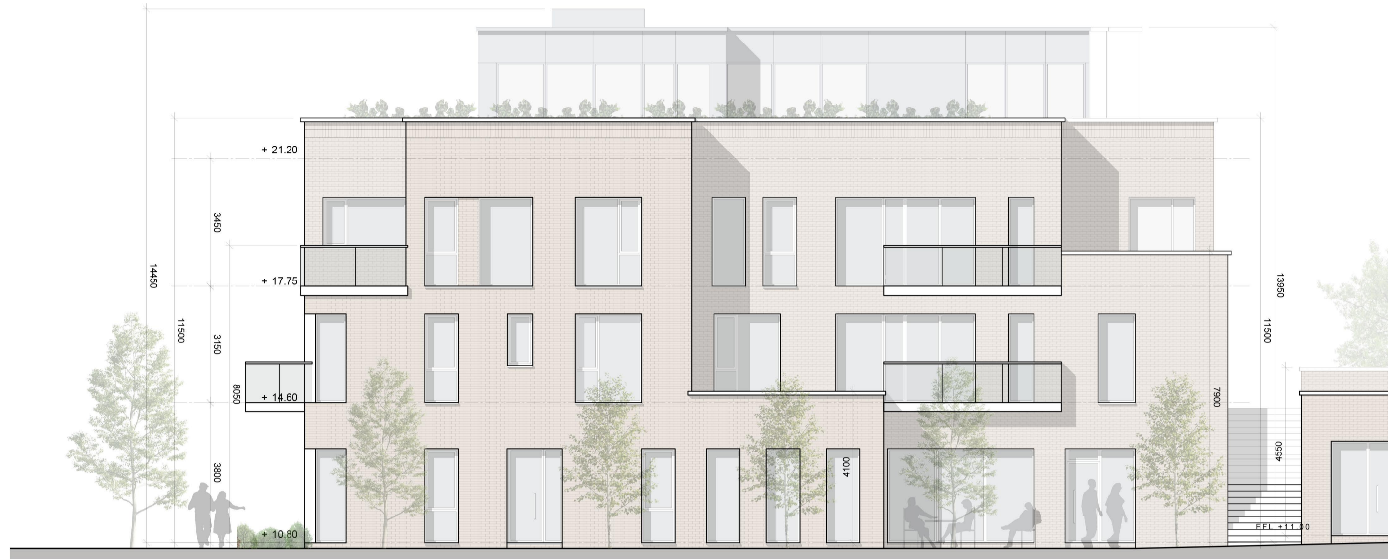
BLOCK 4 SOUTH FACING END ELEVATION SCALE: 1:100