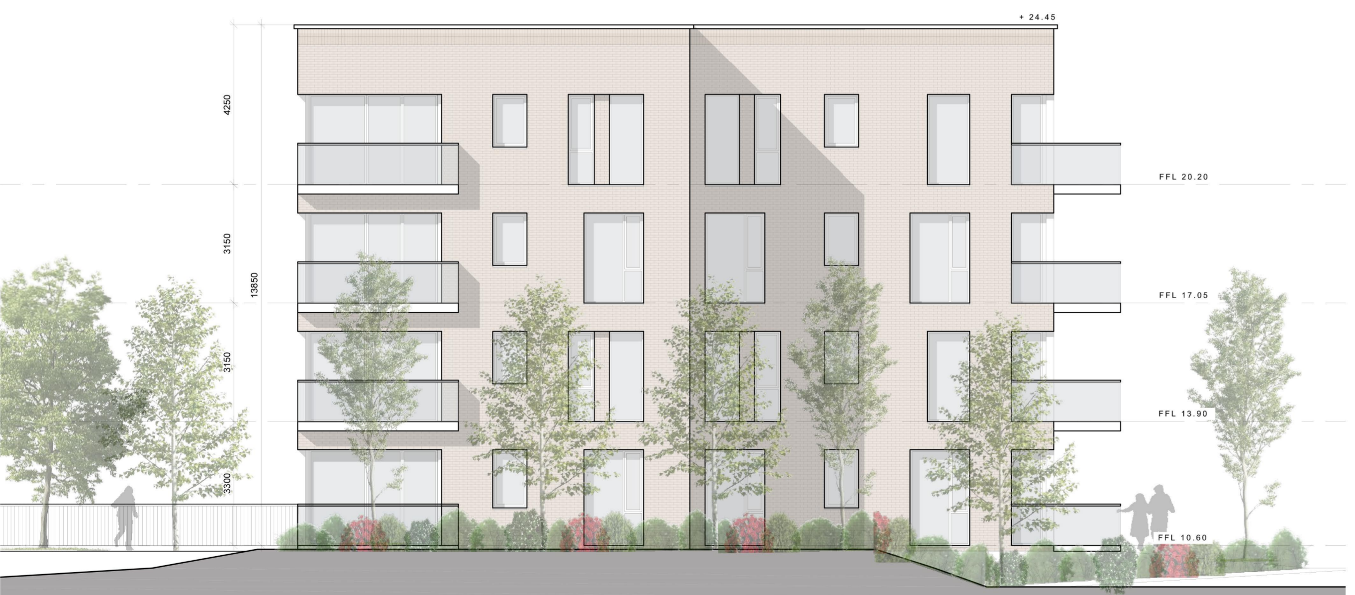
BLOCK 3 SOUTH FACING ELEVATION SCALE: 1:100