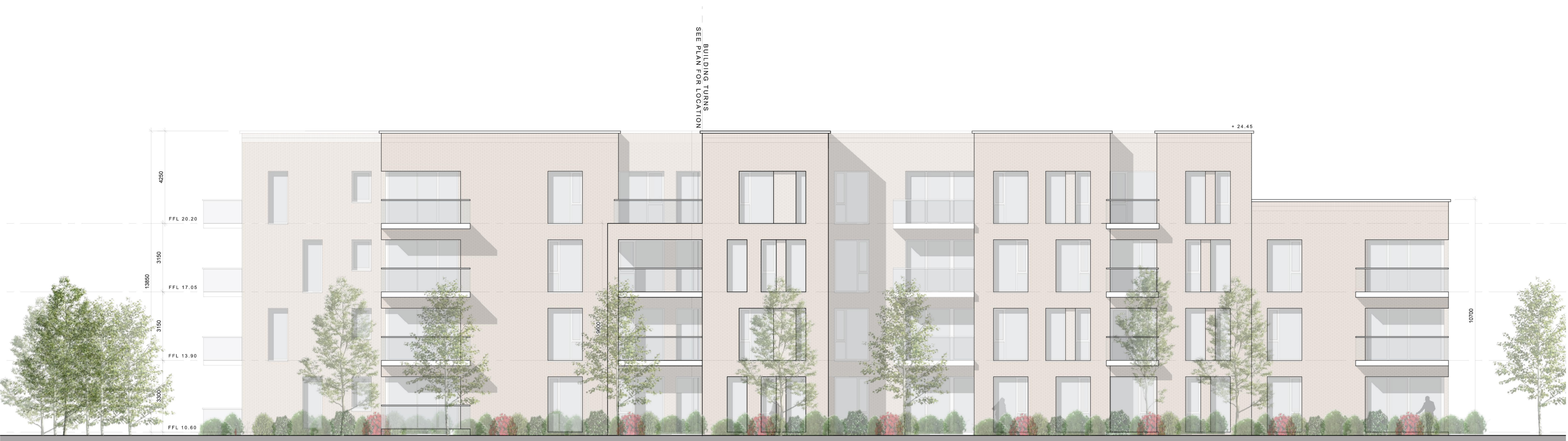
BLOCK 3 EAST FACING ELEVATION SCALE: 1:100