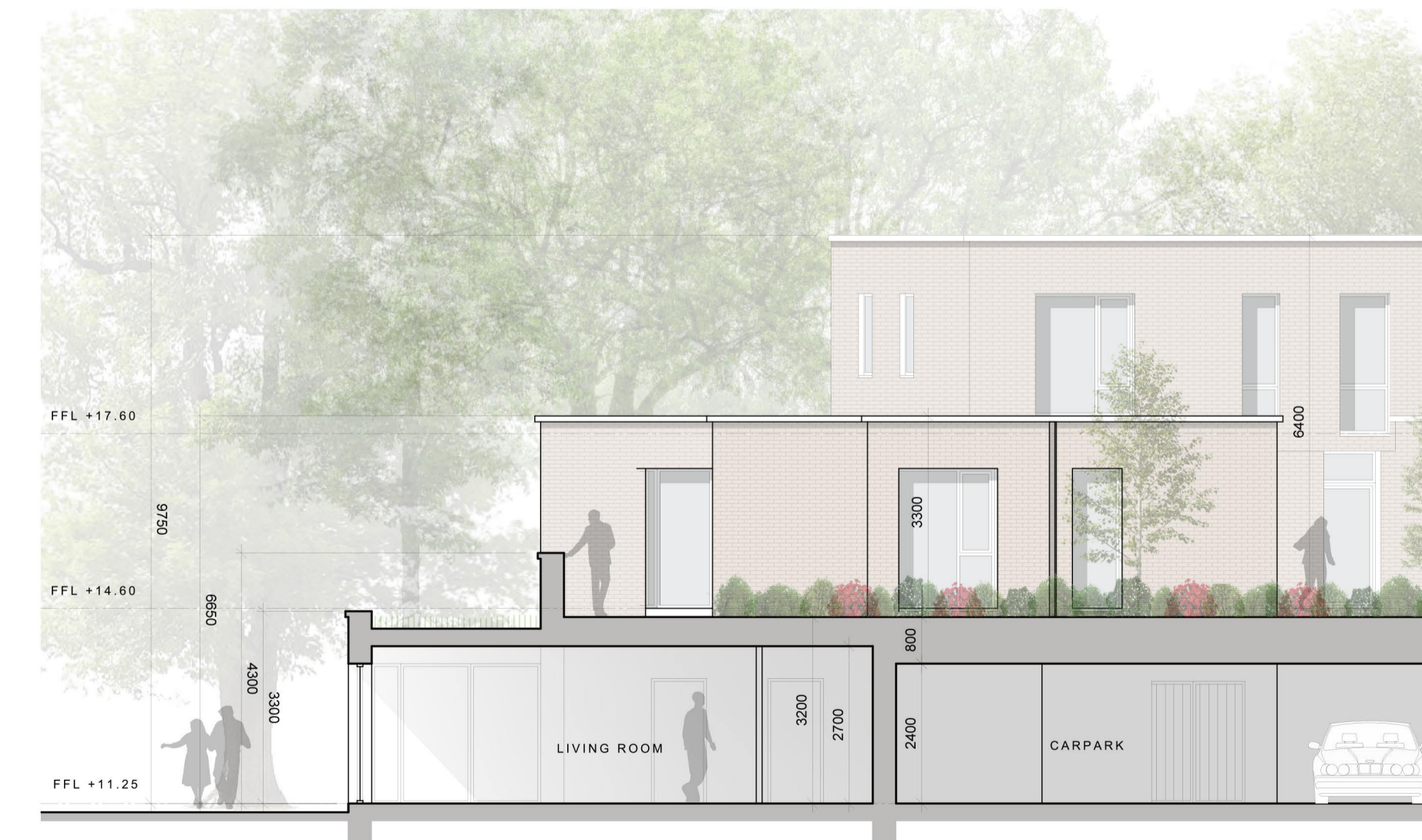
DUPLEX APARTMENT BLOCK 2D: NORTH WEST FACING END ELEVATION /SECTION F4-F4 SCALE: 1:100