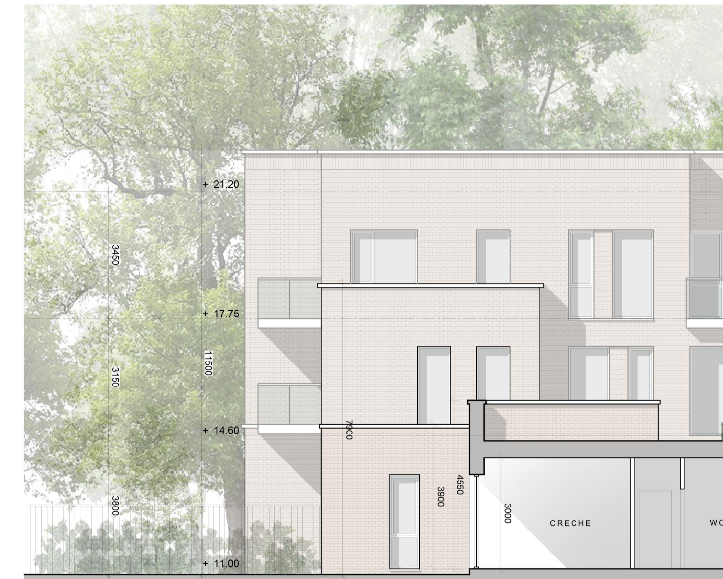
DUPLEX APARTMENT BLOCK 2D: SECTION F6-F6 ADDITIONAL CRECHE ELEVATION SCALE: 1:100