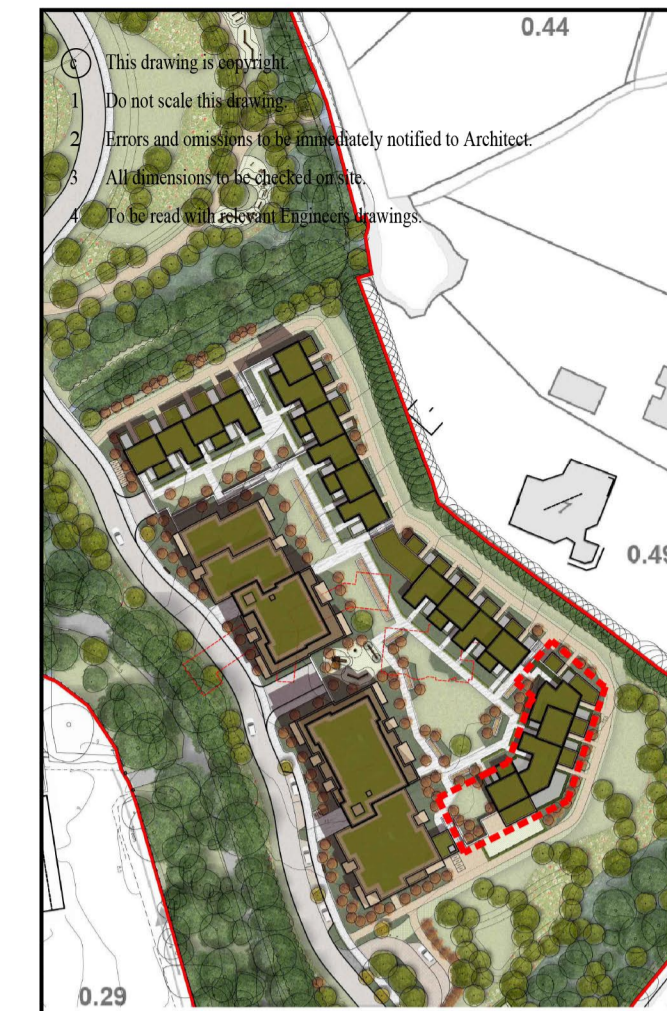
KEY PLAN INDICATING POSITION OF DUPLEX APARTMENT BLOCK 2D NOT TO SCALE © Ordnance Survey Ireland and Government of Ireland Licence No. C.YAL50248313