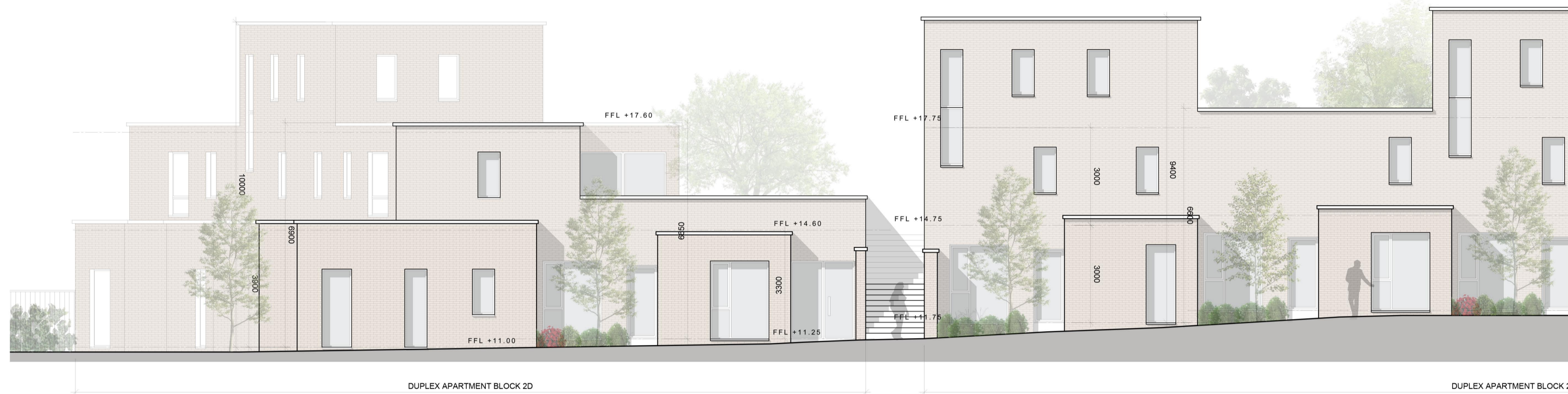
DUPLEX APARTMENT BLOCK 2D: EAST FACING ELEVATION SCALE: 1:100