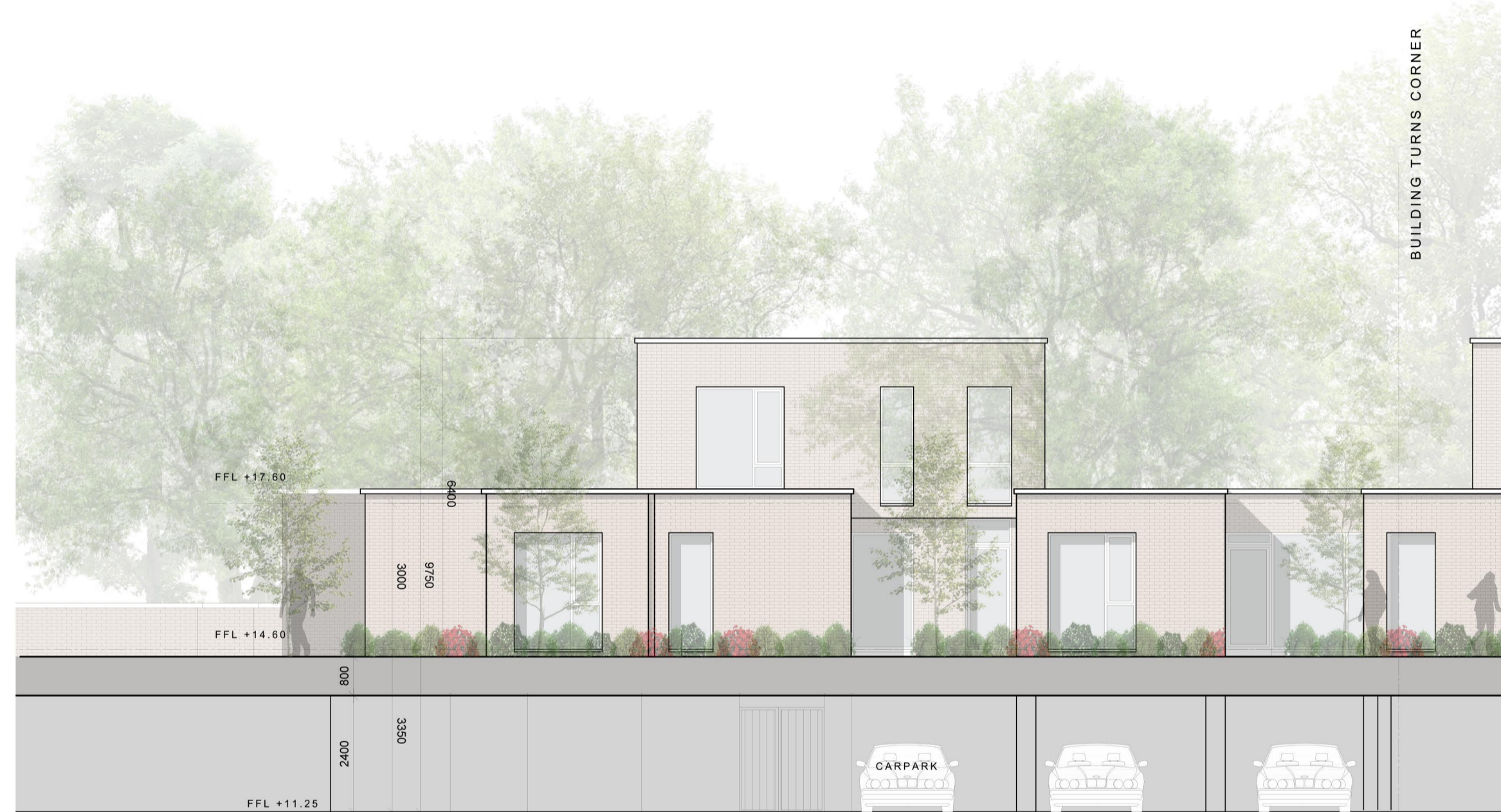
DUPLEX APARTMENT BLOCK 2D: NORTH WEST FACING ELEVATION SCALE: 1:100 EXISTING MATURE PLANTING BEYOND TO DUBLIN ROAD SHOWN INDICATIVELY (SEE ARBORIST'S REPORT FOR DETAILS)

PHONE 66139901 FAX 6765715 E-MAIL info@ceck.ie