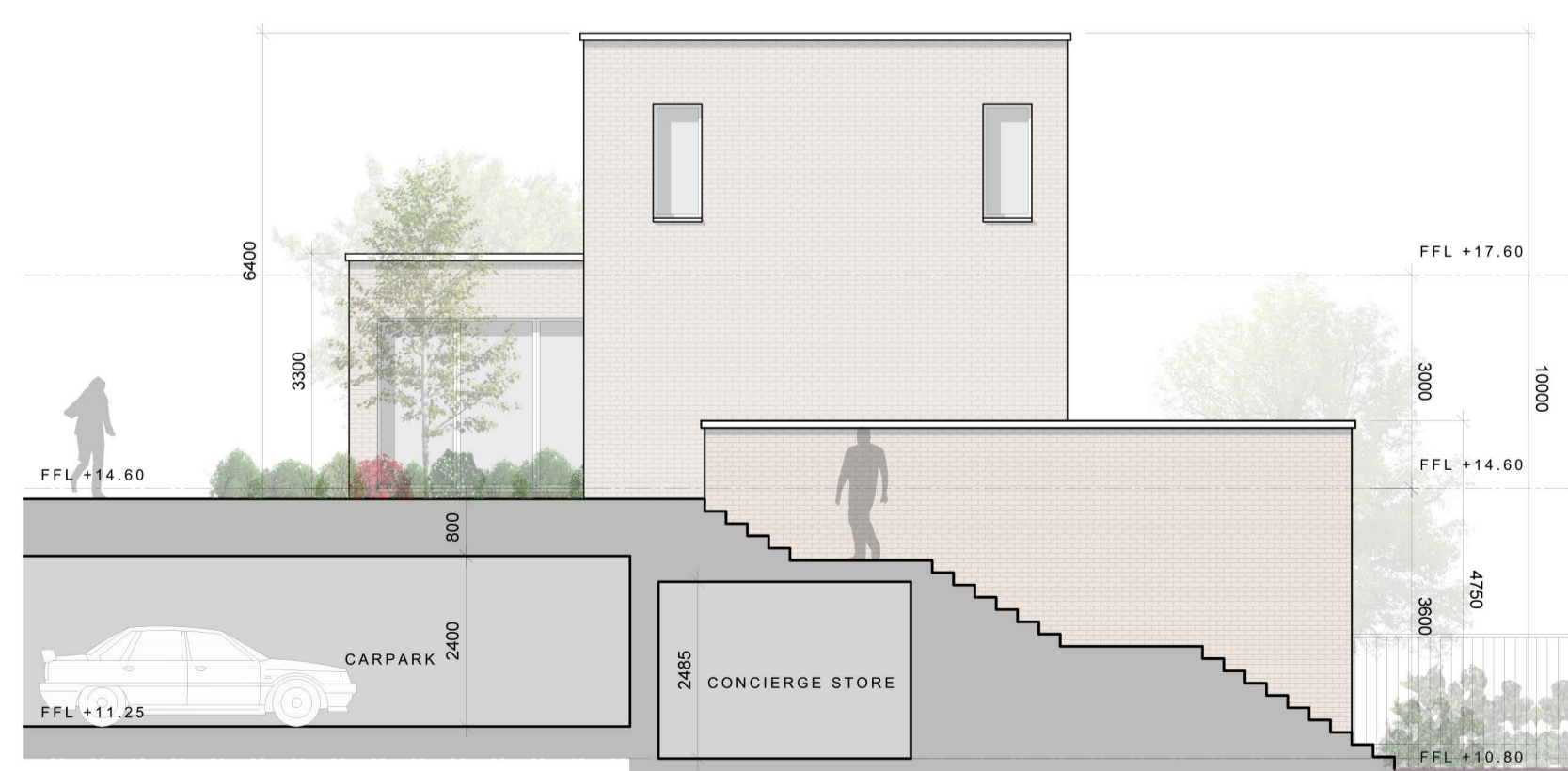
DUPLEX APARTMENT BLOCK 2D: WEST FACING END ELEVATION /SECTION F2-F2 SCALE: 1:100