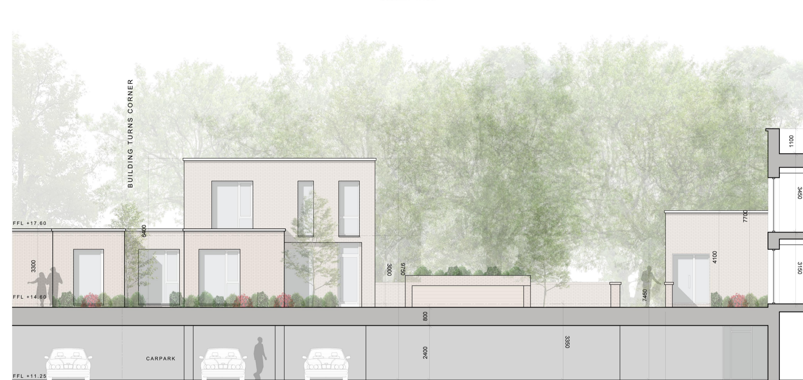
DUPLEX APARTMENT BLOCK 2D: NORTH FACING ELEVATION SCALE: 1:100 EXISTING MATURE PLANTING BEYOND TO DUBLIN ROAD SHOWN INDICATIVELY (SEE ARBORIST'S REPORT FOR DETAILS)