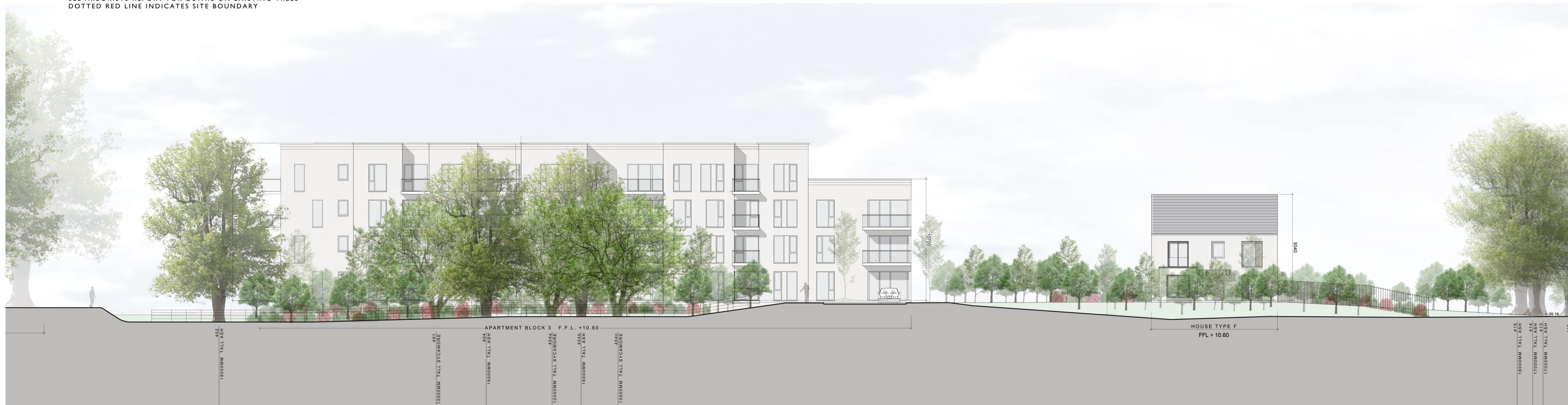
SITE SECTION LI - LI (continued) SCALE: 1:200 NOTE: SEE LANDSCAPE ARCHITECTS DRAWINGS FOR BOUNDARY TREATMENTS SEE ARBORISTS REPORT FOR DETAIL ON EXISTING TREES DOTTED RED LINE INDICATES SITE BOUNDARY