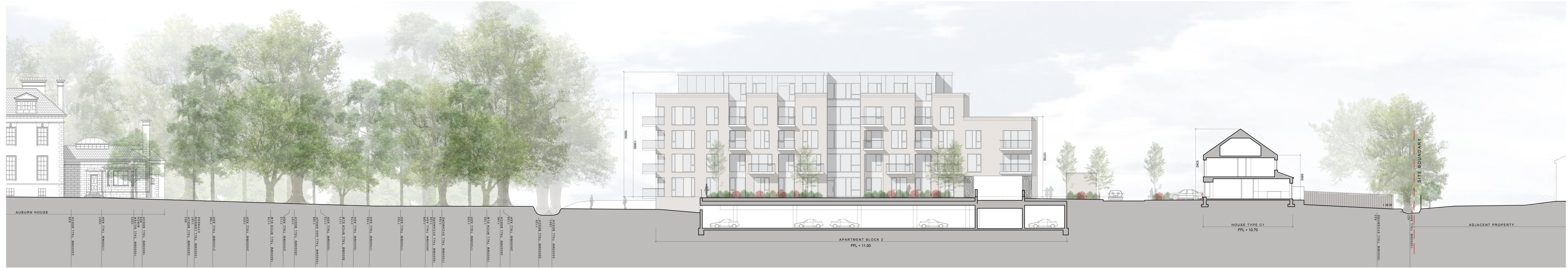
SITE SECTION L - L (CONTINUED) SCALE: 1:200 NOTE: SEE LANDSCAPE ARCHITECTS DRAWINGS FOR BOUNDARY TREATMENTS SEE ARBORISTS REPORT FOR DETAIL ON EXISTING TREES DOTTED RED LINE INDICATES SITE BOUNDARY