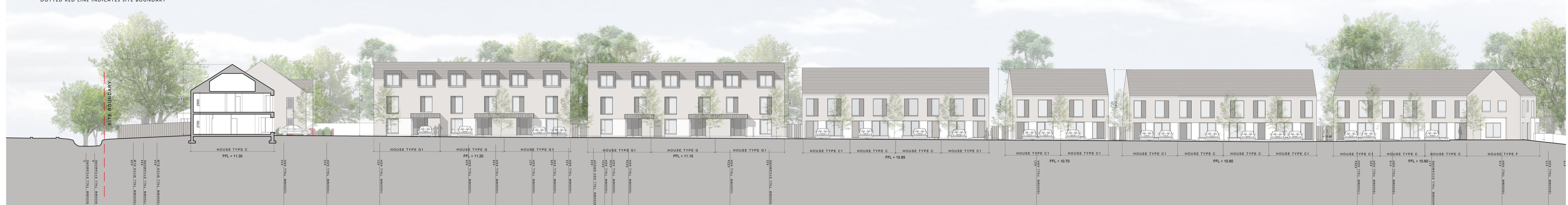
SITE SECTION M - M SCALE: 1:200 NOTE: SEE LANDSCAPE ARCHITECTS DRAWINGS FOR BOUNDARY TREATMENTS SEE ARBORISTS REPORT FOR DETAIL ON EXISTING TREES DOTTED RED LINE INDICATES SITE BOUNDARY