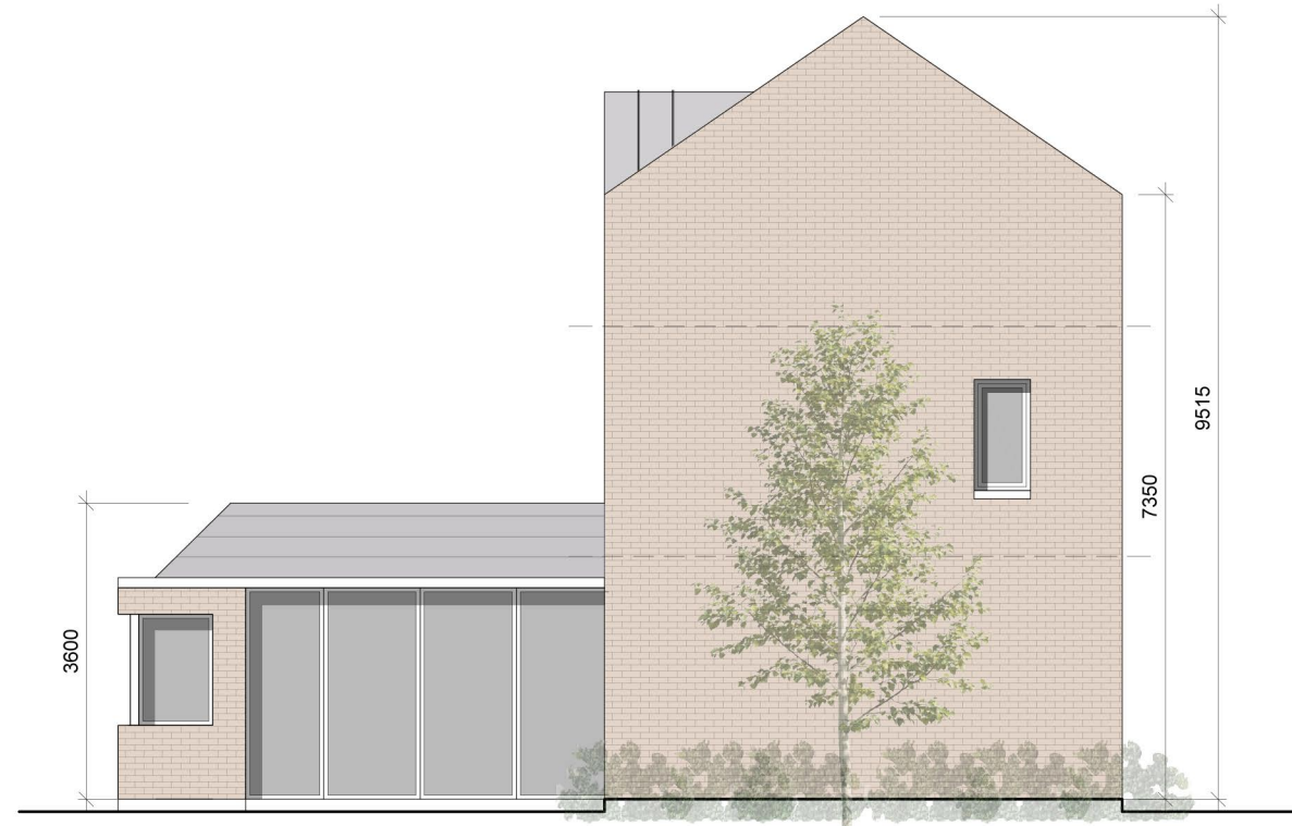
GABLE ELEVATION HOUSE No.49 & 50