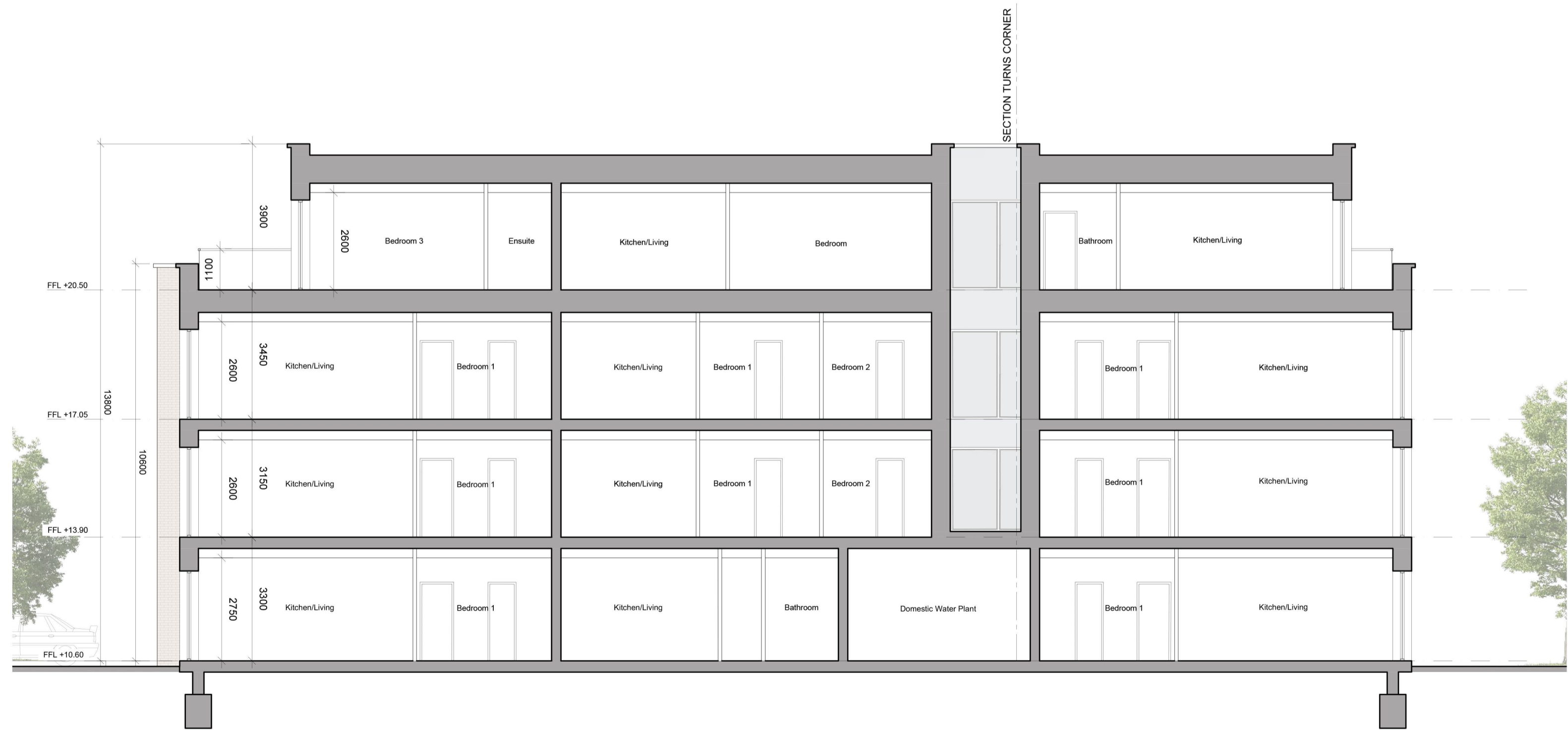
BLOCK 6 SECTION B-B SCALE: 1:100