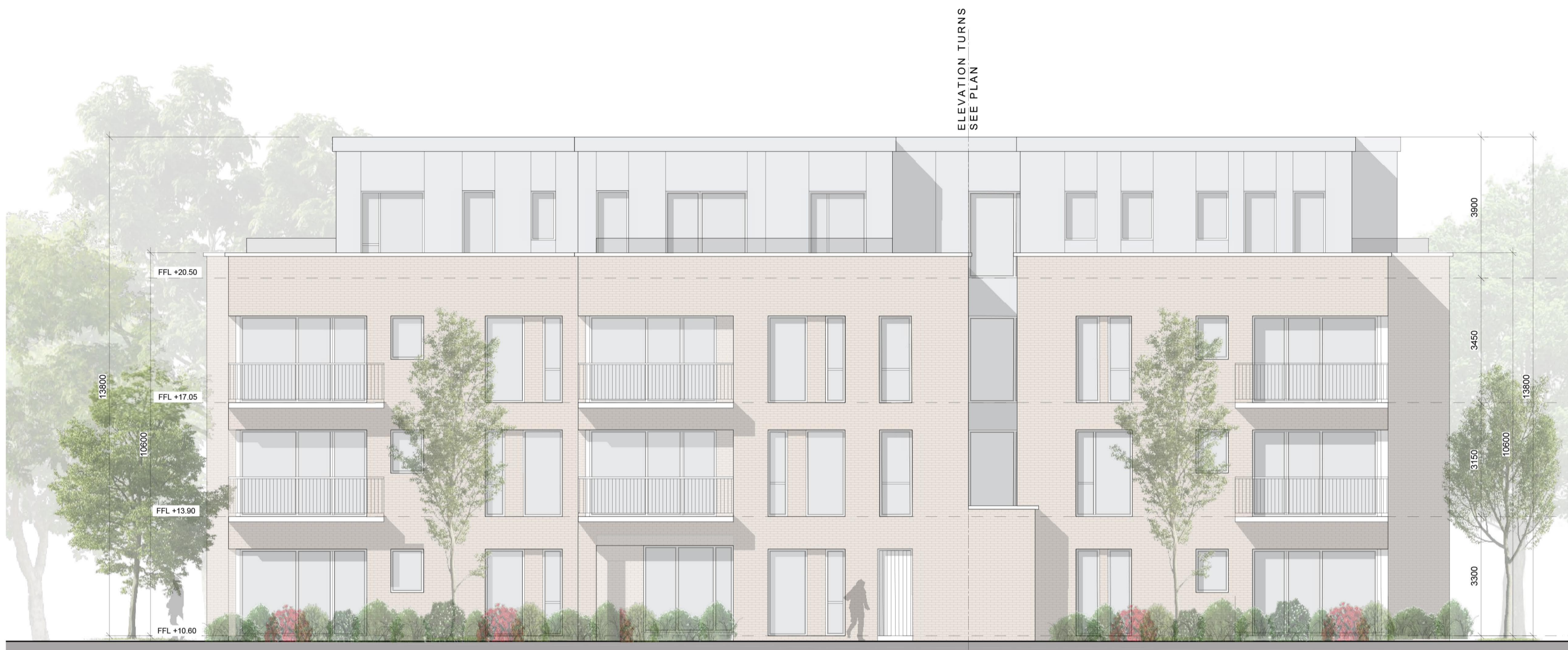
BLOCK 6 EAST FACING ELEVATION SCALE: 1:100 MATURE PLANTING BEYOND SHOWN INDICATIVELY.