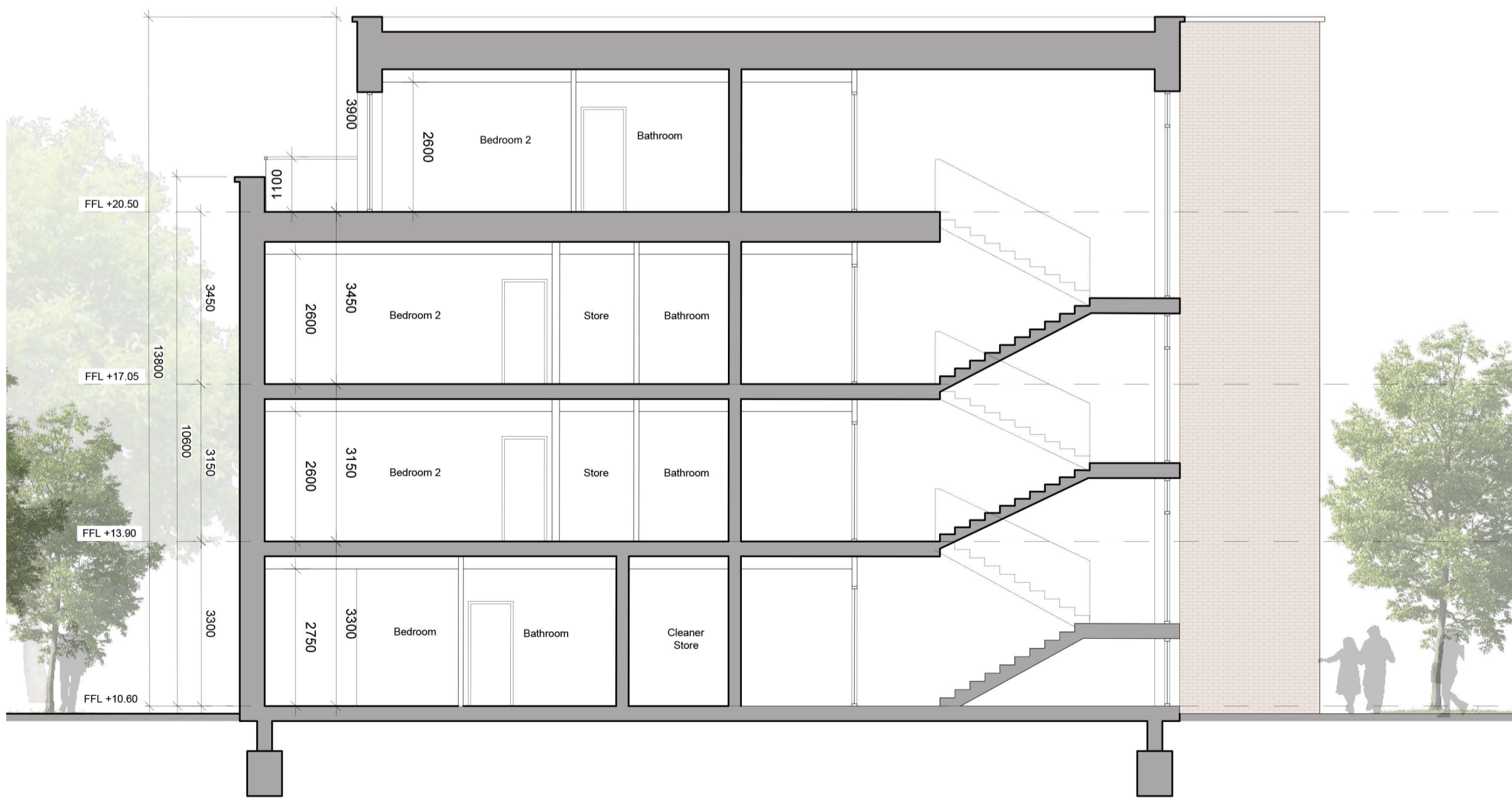
BLOCK 6 SECTION A-A SCALE: 1:100